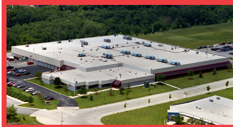
130,000 sq foot Corporate and Manufacturing Facility