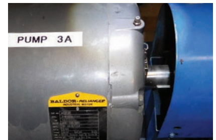
Hot Water Recirculating Pump

The university conducted research and tested several options, including a silver brush contacting the motor shaft. Helwig Carbon Products has developed and refined this technology. It features a specially engineered silver graphite brush that is installed in contact with the motor shaft and connected to ground. This provides for a path of least resistance for the induced currents to get to ground without discharging through the motor bearings.