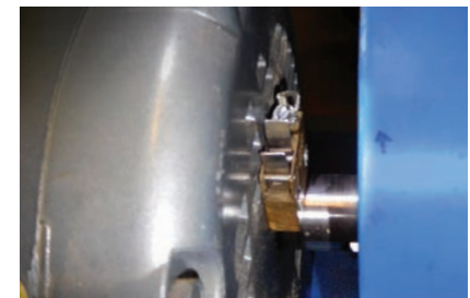
BPK-4 on Pump Motor