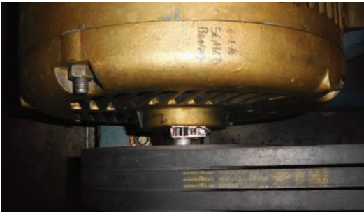
BPK-4 on Air Handling Unit Fan Motor

The Helwig Carbon Products Bearing Protection Kits (BPK) performed exceptionally well and virtually eliminated the high percentage of motor failure rates.