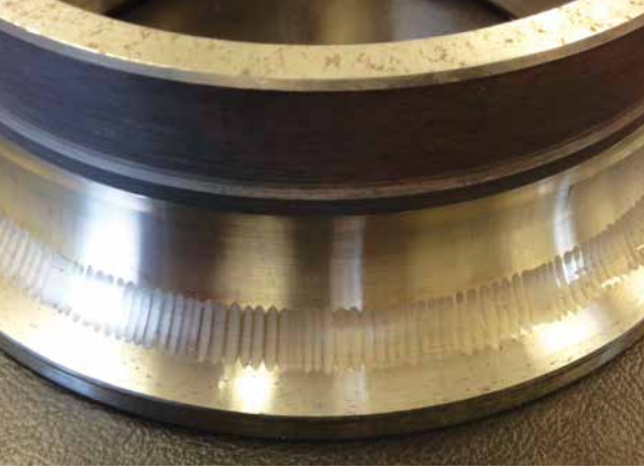
Fluting damage on bearings caused by induced currents passing through the bearings