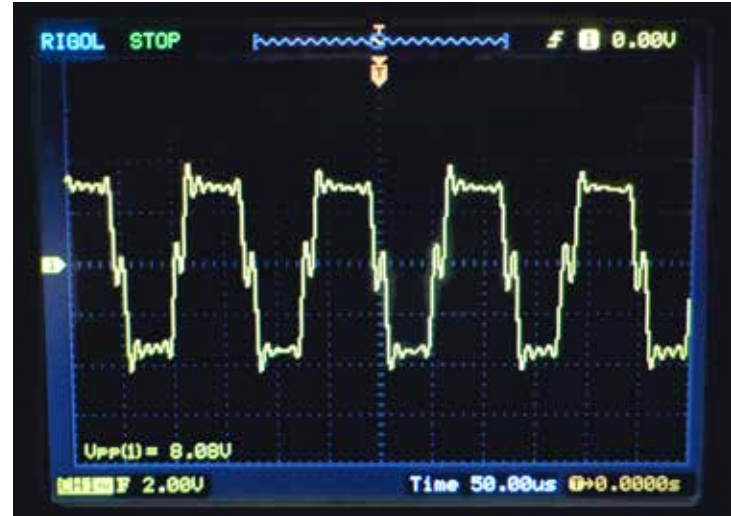
Shaft Voltage Unprotected