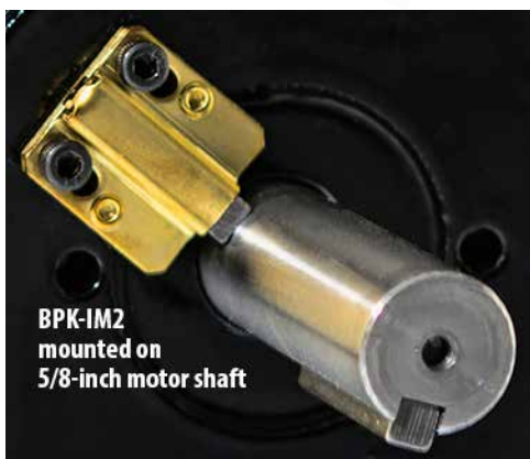
BPK-IM2 mounted on 5/8-inch motor shaft