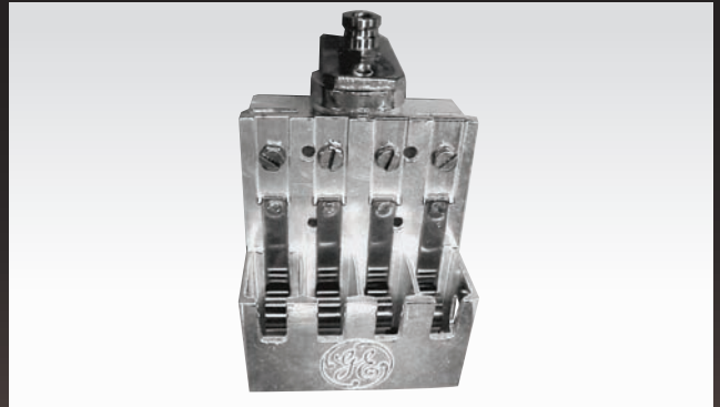
Brush Holder Repair