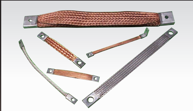
Special Shunts and Braided Cable