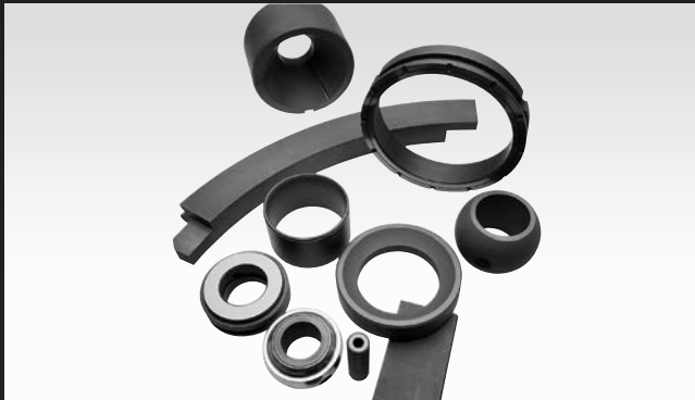
Mechanical Carbons Bearings, Bushings and Seals