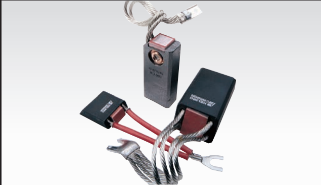
Carbon Brushes Industrial, Fractional, Molded and Metric