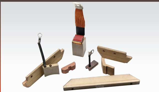
Metal Graphite Brushes and Sliding Contacts