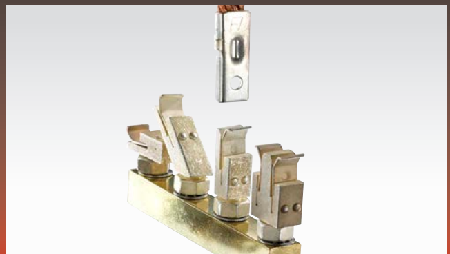
Helwig Quick Disconnect Saves Time, Safe, Better Construction