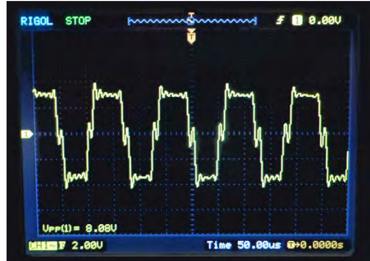
Shaft Voltage Unprotected