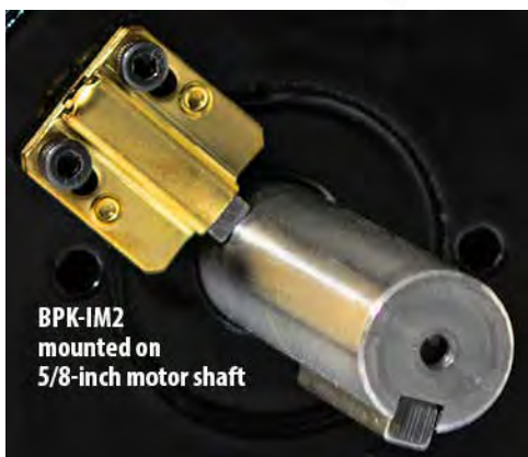
BPK-IM2 mounted on 5/8-inch motor shaft