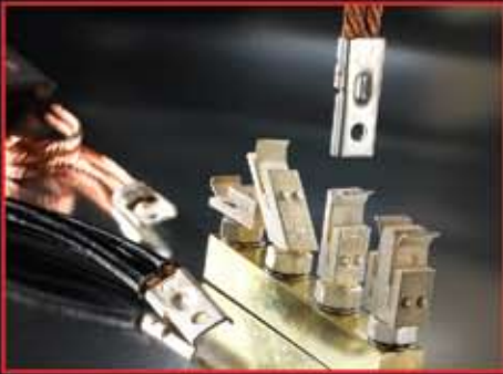
Helwig Quick Disconnect