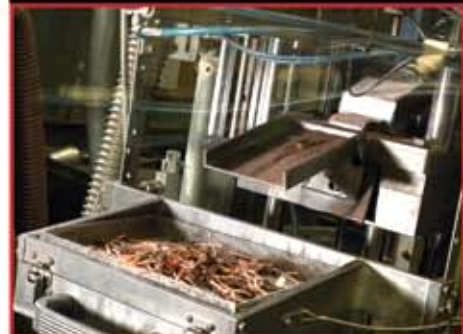
Press to Size